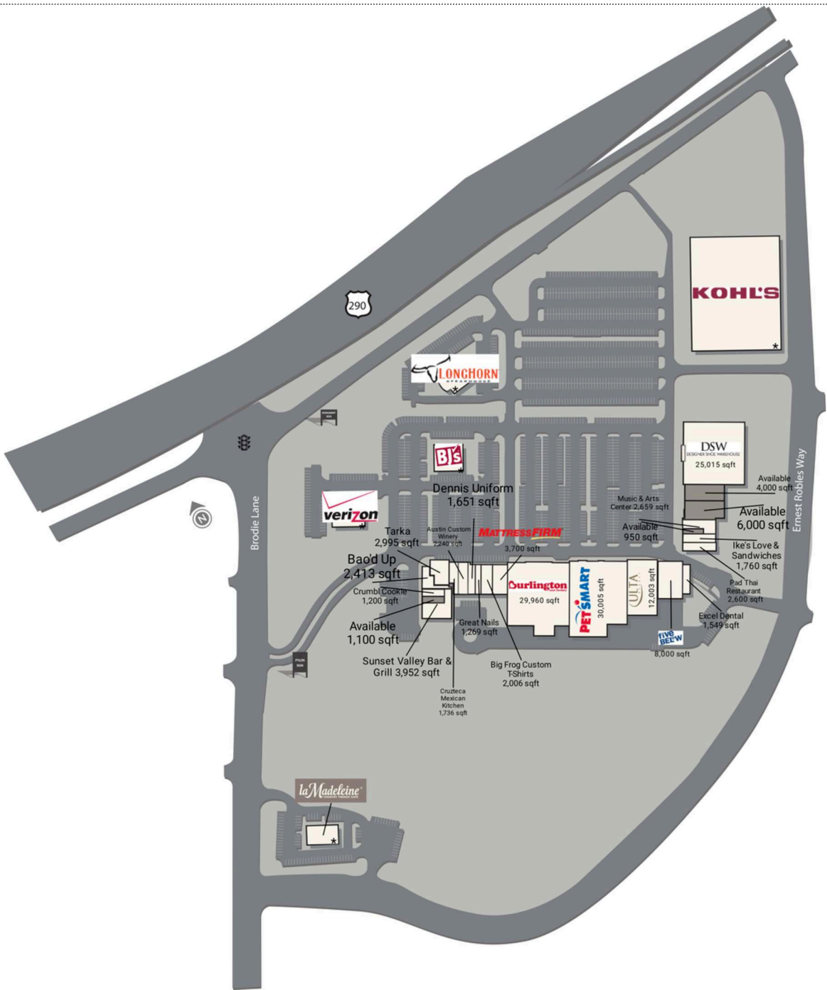
Property Lineup and Square Footage